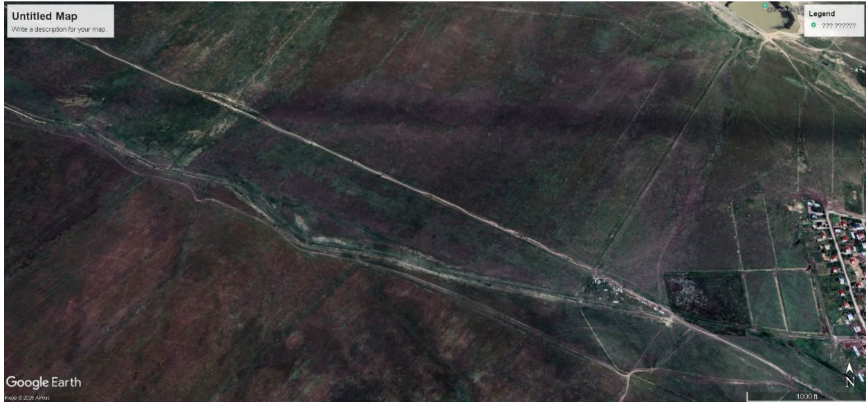
Pic. 1 Proposed route (yellow line) near village Udabno, Iori Plateau, Sagarejo Municipality.