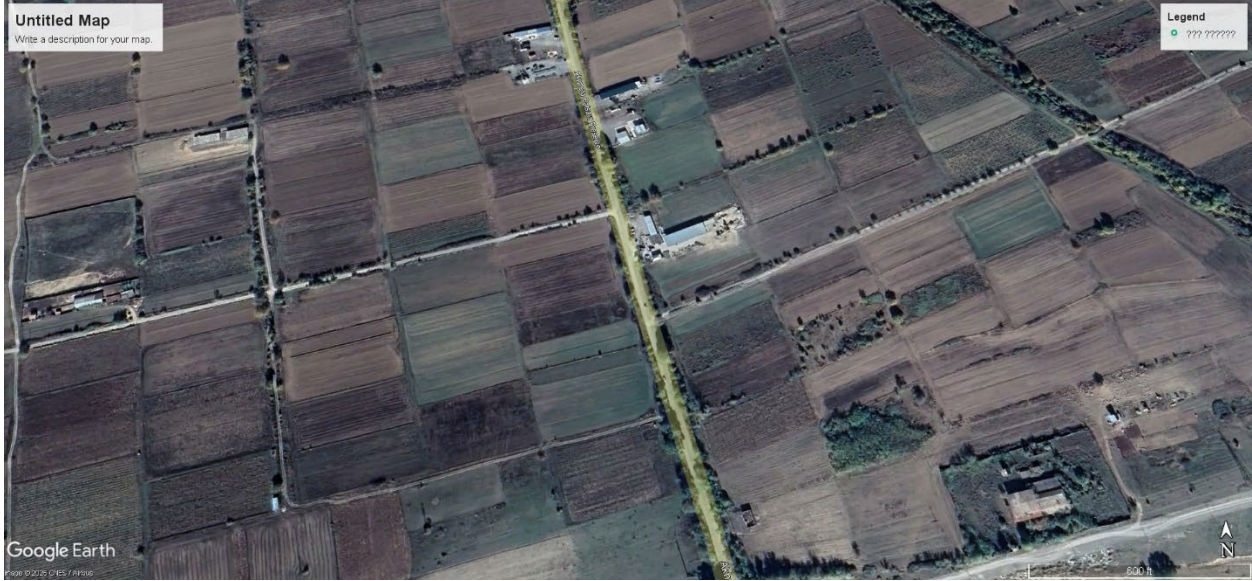
Pic. 5 Proposed route near village Matani, Alazani Valley, Akhmeta municipality, (source-Google Earth Pro).