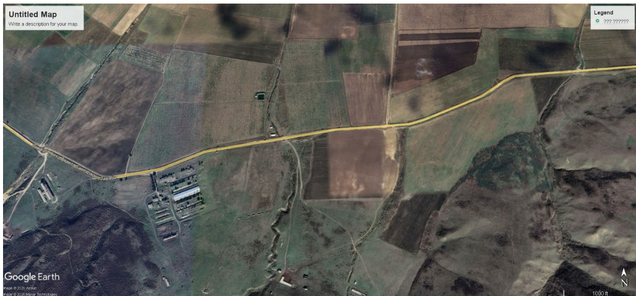
Pic. 2 Proposed route near resort village Khornabuji, Sighnaghi Municipality, (source-Google Earth Pro).