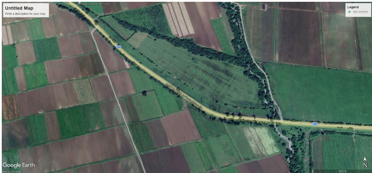
Pic. 4 Proposed route between villages Pshaveli and Napareuli, Alazani valley, Telavi municipality.