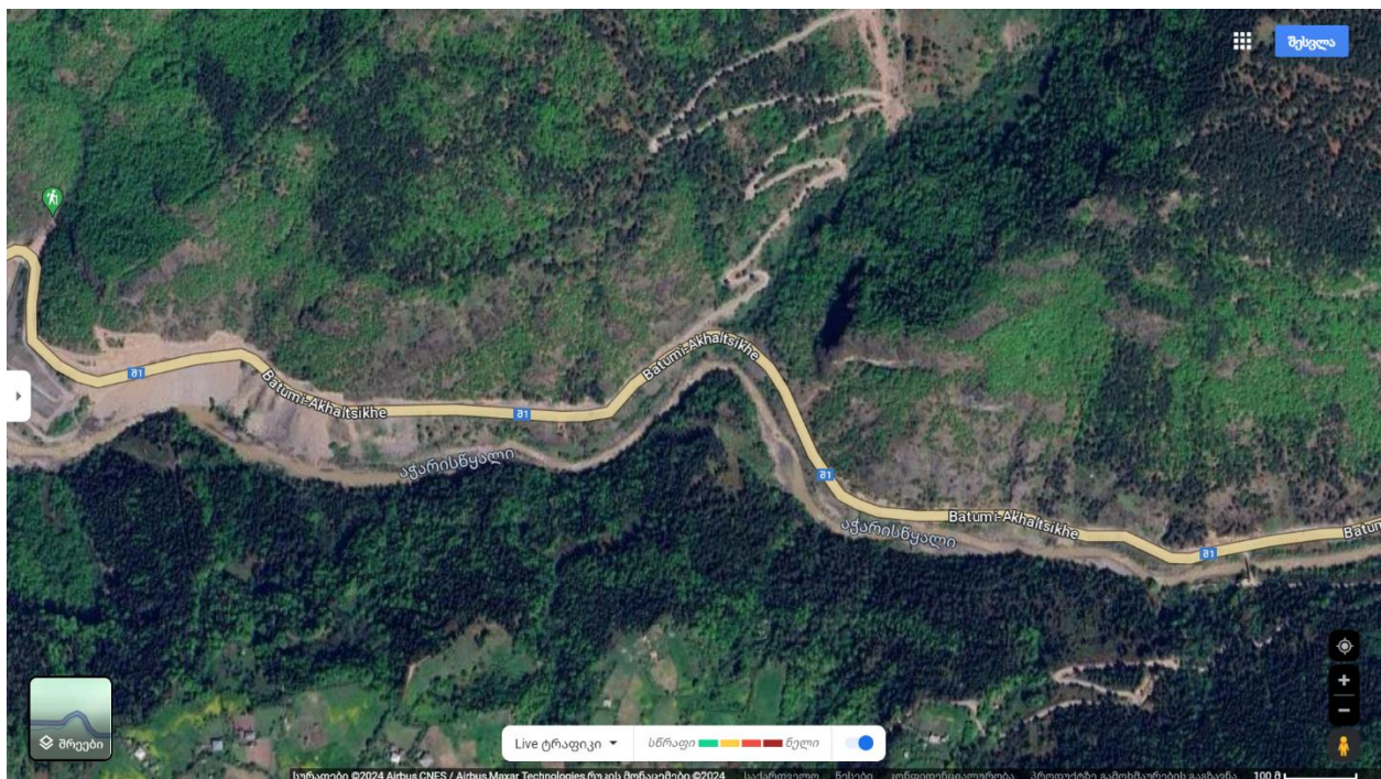
Pic. 6 Proposed route between boroughs Shuakhevi and Khulo, Acharistskali river valley.