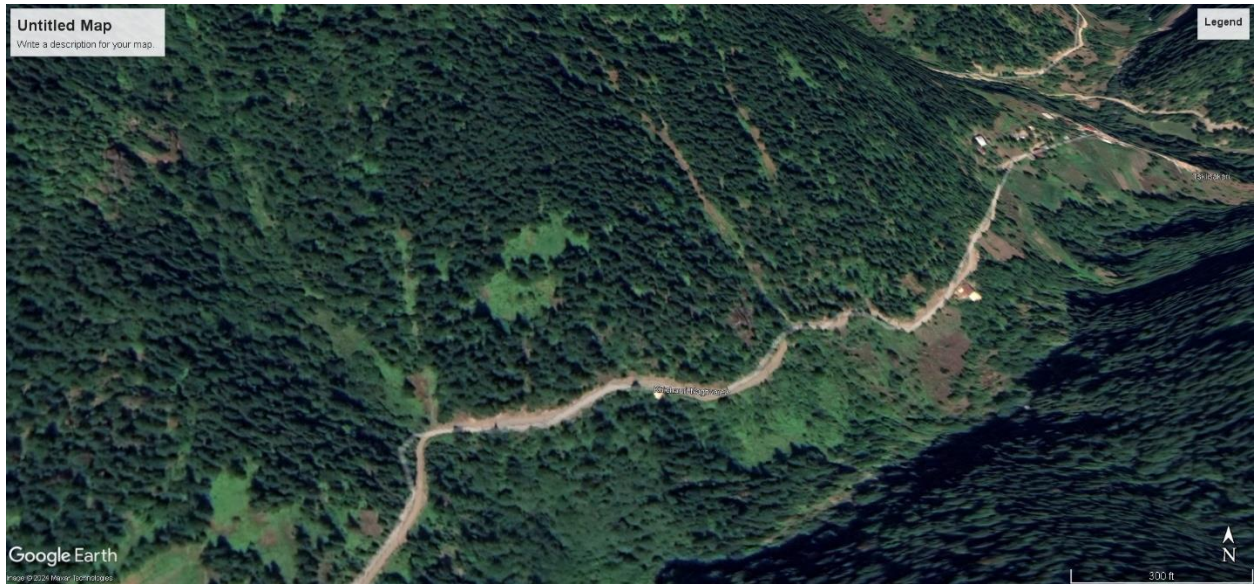
Pic. 5 Proposed route near village Intskirveti, Intskirveti direction, southern slopes of Meskheti ridge, (Shuakhevi Municipality). (source-Google Earth Pro).