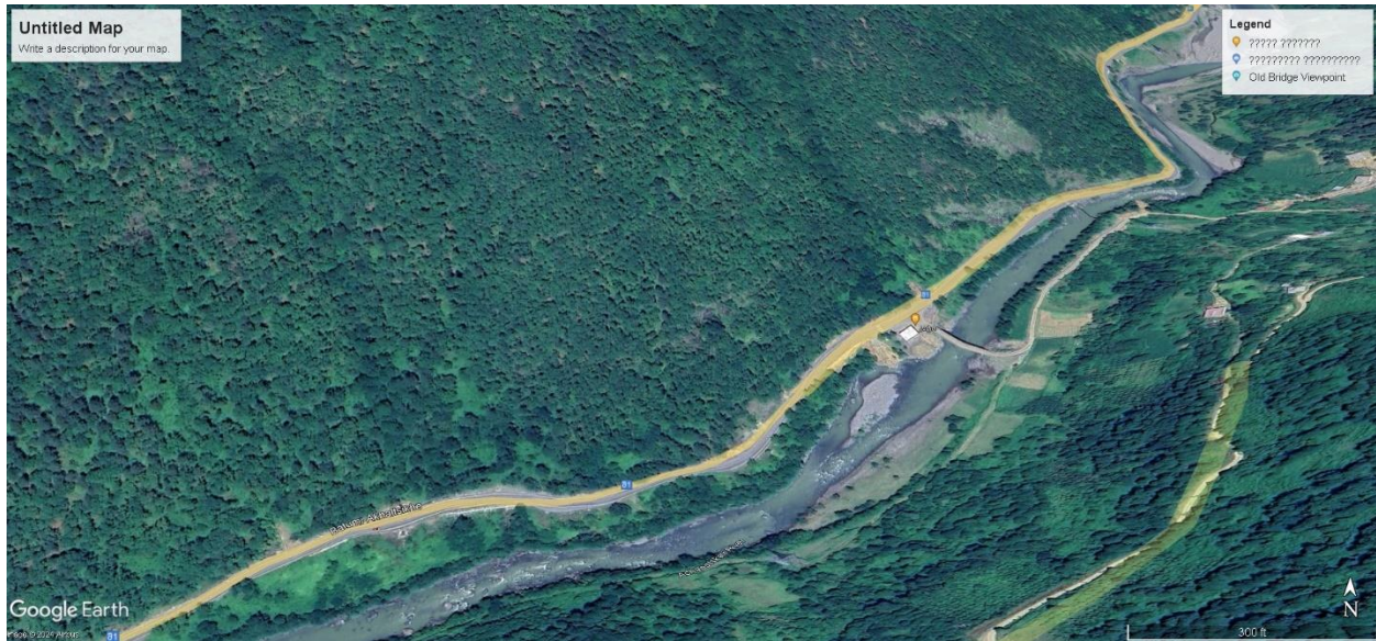
Pic. 3 Proposed route near borough Keda, Acharistskali valley (Keda Municipality). (source-Google Earth Pro).