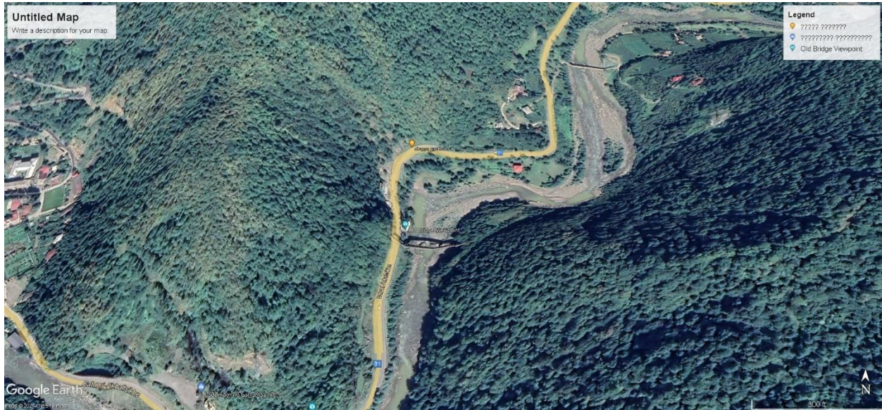
Pic.1 Proposed route between village kvemo Makhuntseti and borough Keda; Acharistskali river valley (Keda Municipality).