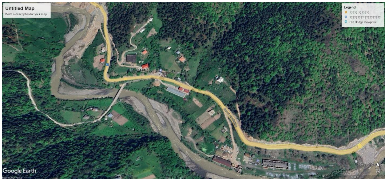
Pic. 4 Proposed route near borough Shuakhevi, (Shuakhevi Municipality). (source-Google Earth Pro).