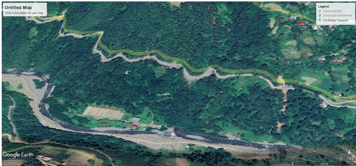
Pic. 2 Proposed route between borough Keda and village Gundaure; northern foothills of Shavsheti mountain ridge (Keda Municipality).