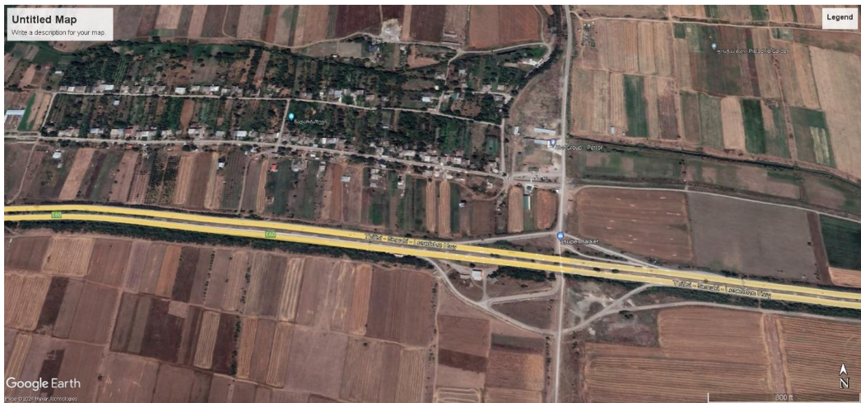
Pic. 4. Proposed route near village Nadarbazevi, (Gori Municipality, central part of Shida Kartli plain) (source-Google Earth Pro).