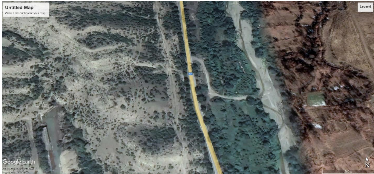
Pic. 5. Proposed route near Kaspi, (Kaspi Municipality); (source-Google Earth Pro).