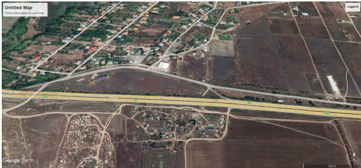
Pic. 6. Proposed route near village Dzveli Kanda, (Mtskheta Municipality); (source-Google Earth Pro).