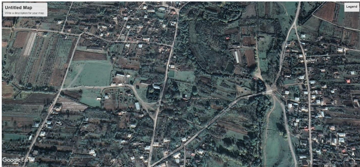
Pic. 2. Proposed route between villages Aradeti and Tsveri, (Kareli Municipality, western part of Shida Kartli plain).