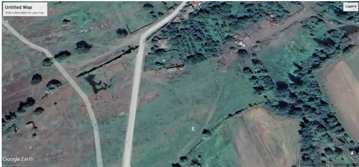
Pic. 1. Proposed route near village Sative, (Khashuri Municipality, western part of Shida Kartli plain). (source-Google Earth Pro).