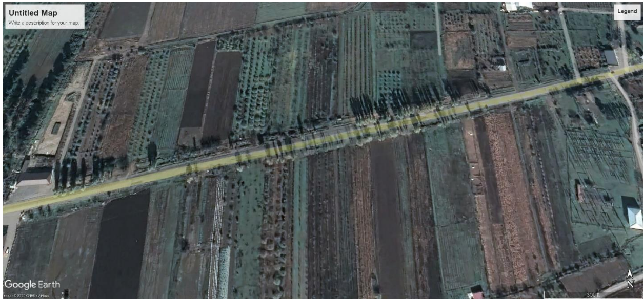
Pic. 3. Proposed route between Kareli and village Kekhijvari, (Kareli Municipality).