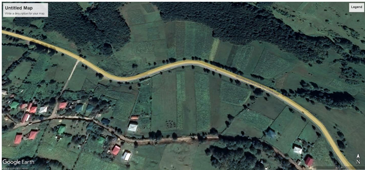
Pic. 4 Proposed route near village Korbouli, along the Gomi-Sachkhere road. (Sachkhere Municipality). (source-Google Earth Pro).