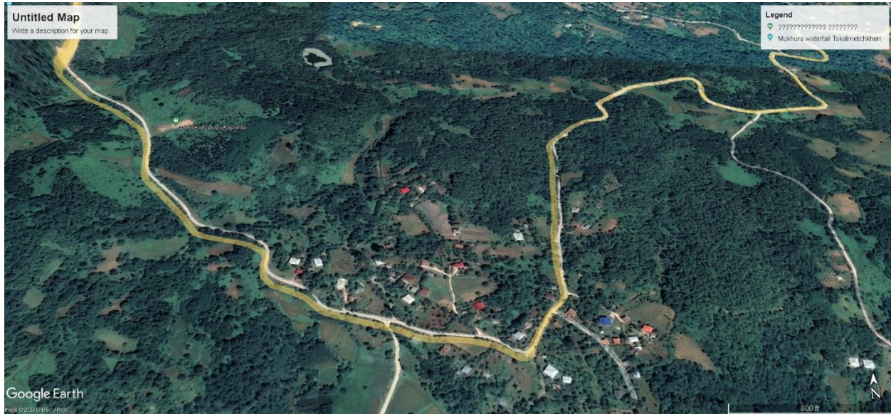
Fig.1 Proposed route near village Mukhura, southern slopes of Racha Ridge (Tkibuli Municipality). (source-Google Earth Pro).