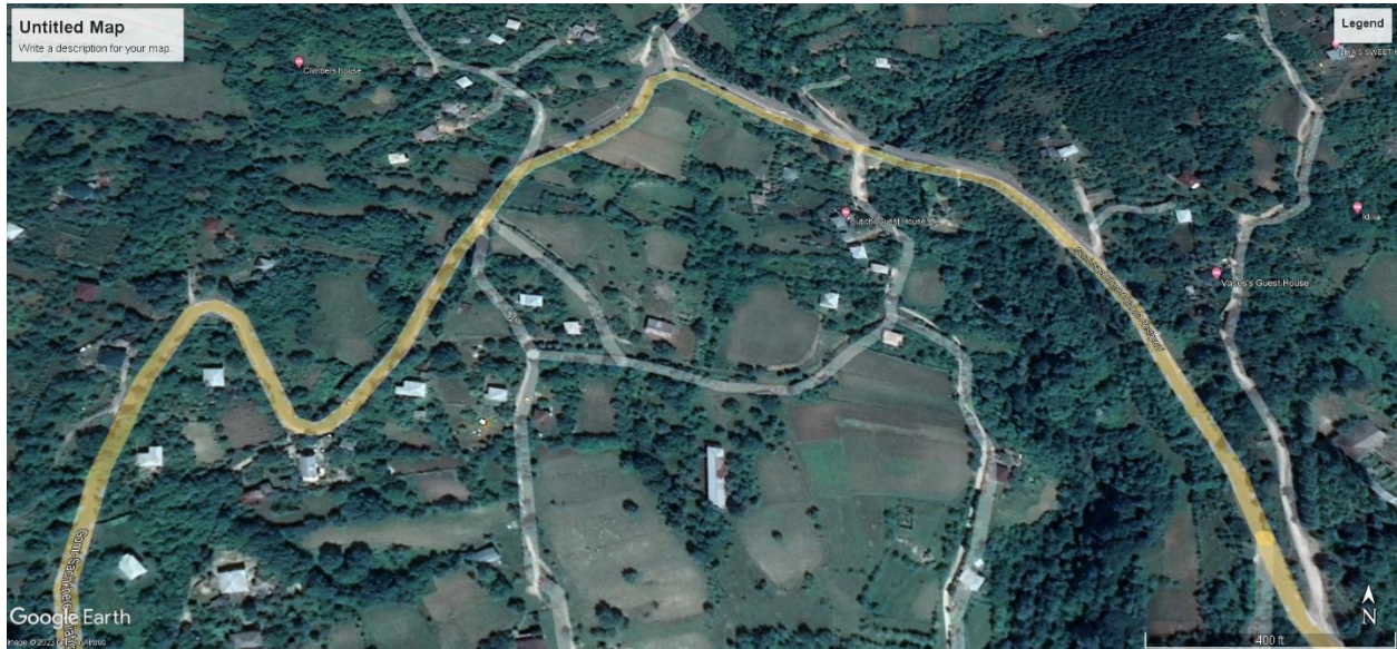
Pic. 5 Proposed route near village Katskhi, typical landscape of Imereti Upland, (Chiatura Municipality). (source-Google Earth Pro).