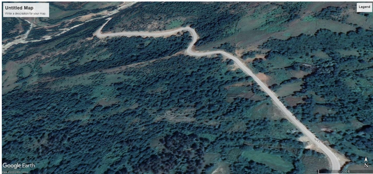
Pic. 3 Proposed route near village Kvemo Khevi, Sachkhere Municipality. (source-Google Earth Pro).