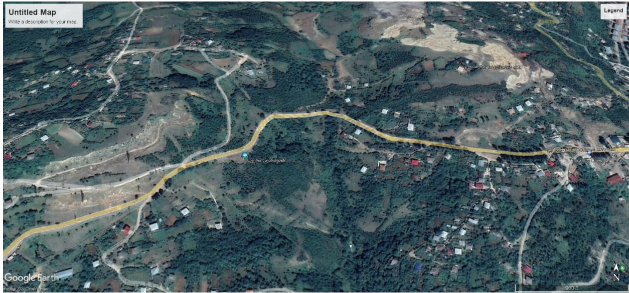
Pic. 6 Proposed route near Chiatura, (Chiatura Municipality).